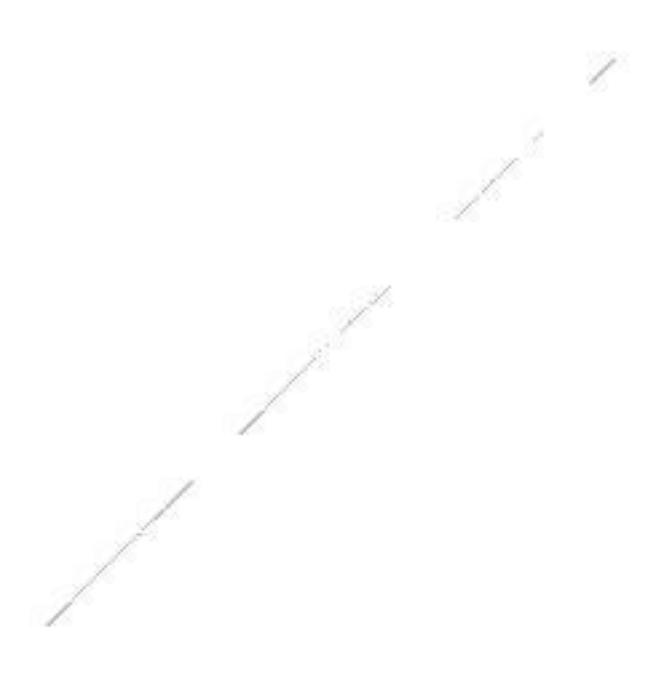
Page 6 of 26 - Review of the Gwent Frailty Programme –Phase Two - Aneurin Bevan University Health Board, Blaenau Gwent County Borough Council, Caerphilly County Borough Council, Monmouthshire County Council, Newport City Council, Torfaen County Borough Council