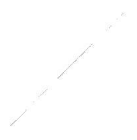
Page 22 of 26 - Review of the Gwent Frailty Programme –Phase Two - Aneurin Bevan University Health Board, Blaenau Gwent County Borough Council, Caerphilly County Borough Council, Monmouthshire County Council, Newport City Council, Torfaen County Borough Council

External review (Wales Audit Office) report to Audit Committee.